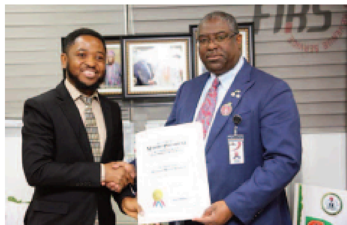
▲ He counts three Lifetime Achievement Awards in Higher Education.