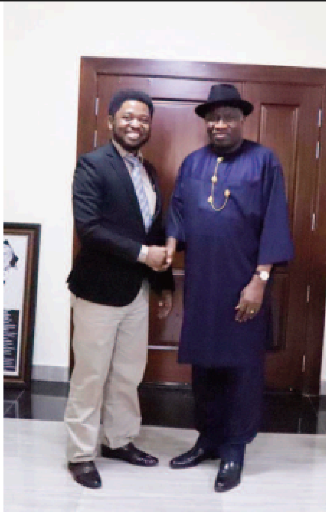
▲ Serving and former African Presidents including H.E Goodluck Jonathan acclaim his expertise in ICT.