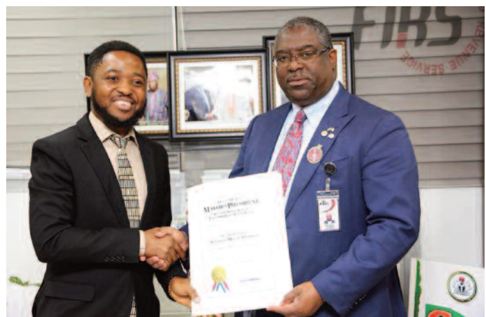
▲ He counts three Lifetime Achievement Awards in Higher Education.