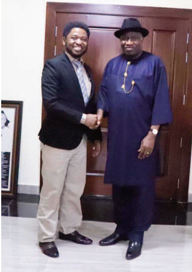
▲ Serving and former African Presidents including H.E Goodluck Jonathan acclaim his expertise in ICT.